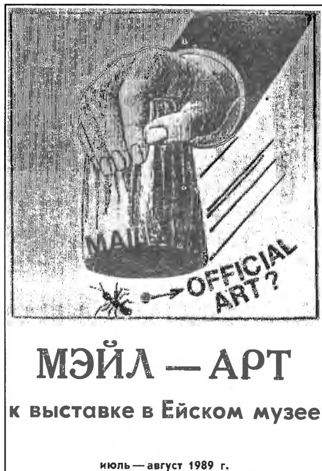
Figure 61. Serge Segay, Mail Art , Russia, 1989. Pamphlet.

All of these exhibitions and activities became possible with the advent of "glasnost." Government agencies that previously incarcerated artists suddenly began signing release forms for the publication of posters. But these authorities